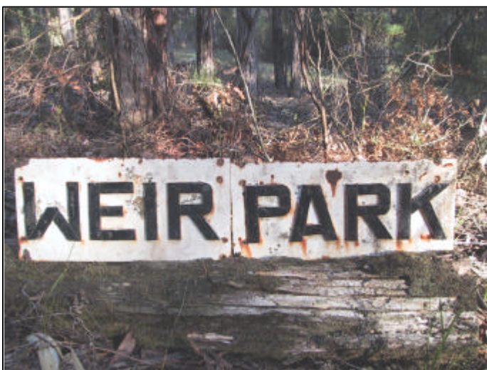
Weir Park sign (in storage) Date: 20-07-03

Morwell National Park was originally declared on November 26, 1966 to become Victoria's 20 th national park. Since then, there have been a number of additions made to increase the size of the park to over 500 ha. The most important addition was the Billys Creek Valley extension in 1989. This included land bounded by Junction Road, Jumbuk Road and Reidy's Road towards the east.