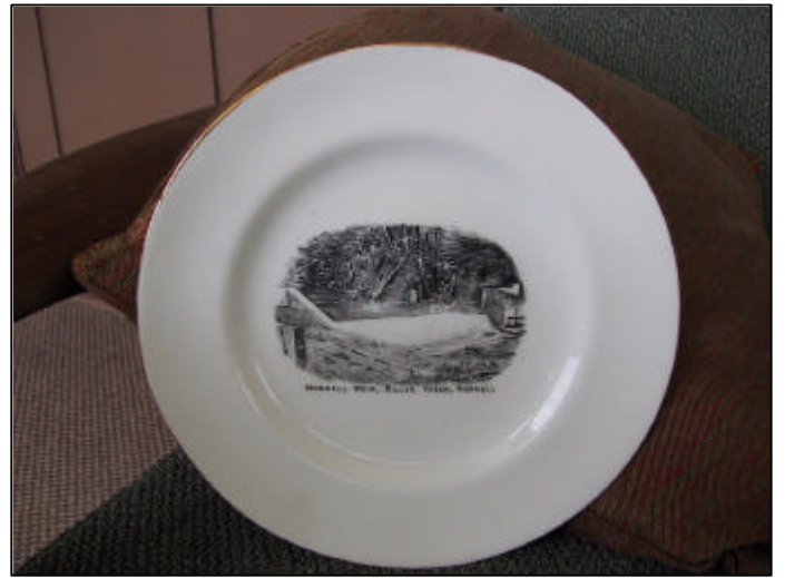
Dinner Plate (30cm) of Weir Date: 8-9-01

Rob de Souza-Daw has photocopies of 2 pictures depicting the Northway family at Billys Creek taken in c.1906 & the Northways and Mackeys in c.1908