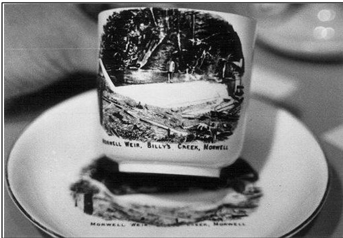
Weir Cup & Saucer (Owner unknown)

After the construction of the Weir it became a popular picnic spot with visitors driving in by horse and buggy. It would appear that a special dinner set was struck at some stage with pictures of the Morwell Weir printed on plates, saucers and cups. A few of these items can still be found in the possession of some families living in Morwell.