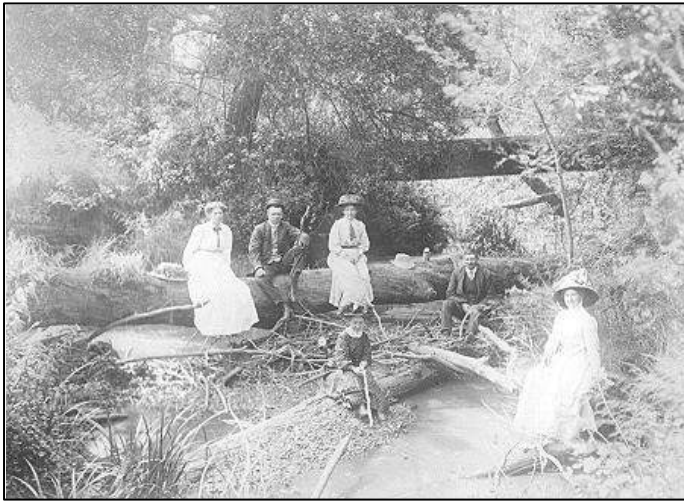
Northway Family at Billys Creek Date: c.1906

(A brief history of Billys Creek compiled by Hilmar Batza – September 2003)