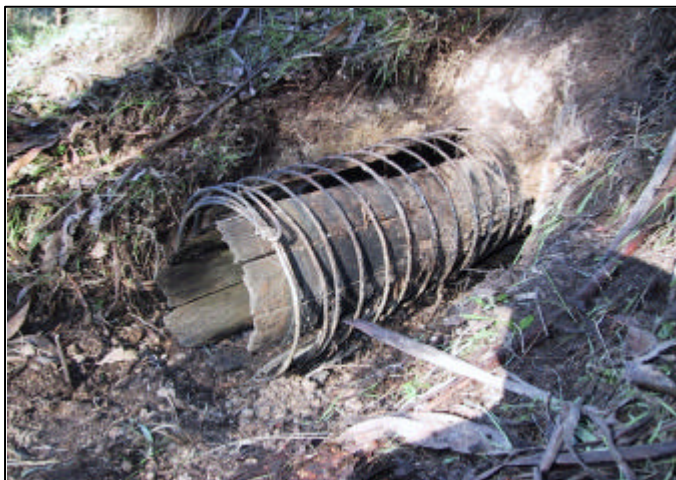
Remains of old pipe-line Date: 20-07-03