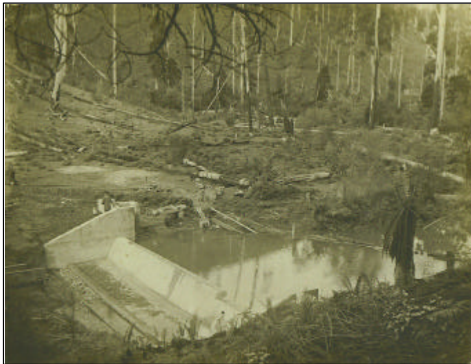
Weir under construction Date: c. 1913