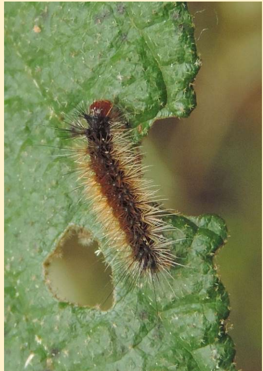
Tiger Moth ( Ardices )