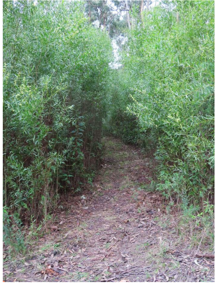
Muttonwood Track - after

While working on Muttonwood Track, Cathy was busy collecting photos of orchids, insects and fungi located during the trek. The descriptions are quick identifications by Mike. This shows that if you look carefully there are many treasures to be found in all parts of the Park.