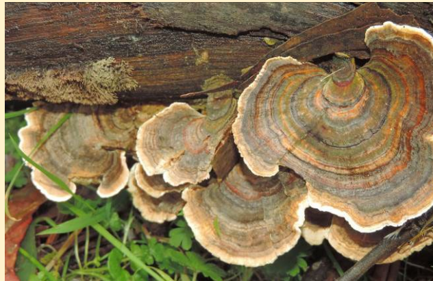
Rainbow Bracket/Turkeytails ( Trametes versicolor )