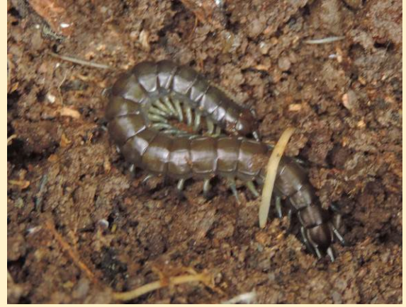
Common Centipede ( Cormocephalus esulcatus )