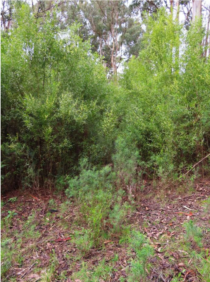
Muttonwood Track - before

to finish after lunch and return at another activity to continue the track.