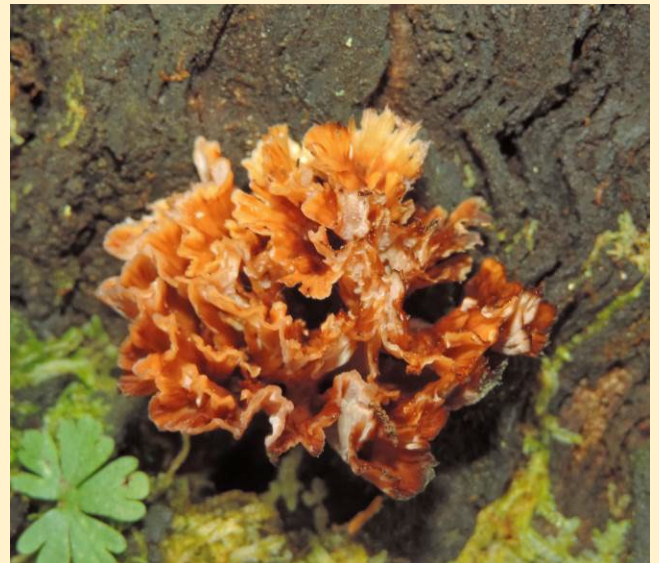
Wine Glass Fungus ( Podoscypha petalodes )