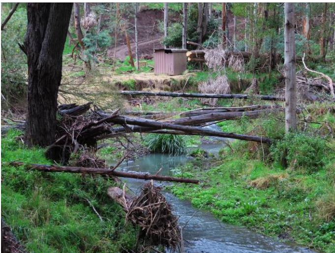
A new shed and track created on the northern side of Billy's Creek.