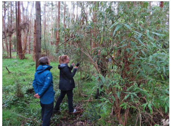
Surveying one of the nesting boxes – Matt is operating the pole mounted camera while Anita analyses the video footage on the handset.

After Section C was completed the group stopped for lunch beside the track. During lunch it started to rain. It had been good to go for a few hours without rain, but we needed to finish after lunch. The pole mounted camera was not to get wet so the activity needed to finish at the first sign of decent rain. At the next activity we plan to finish the survey and make replacement and repairs to missing and damaged boxes.