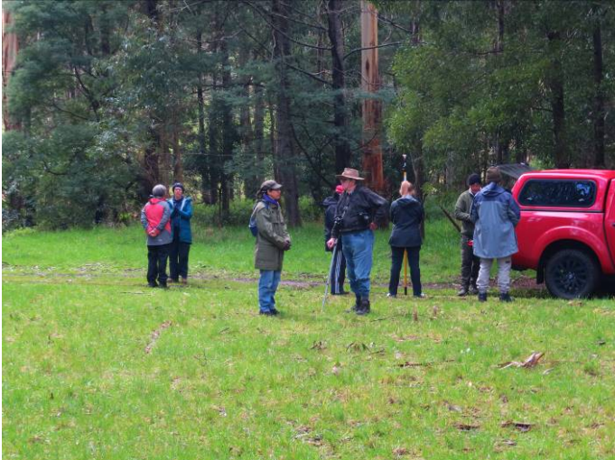
The group organising to survey the first box.

During the activity we worked down the main track and observed: