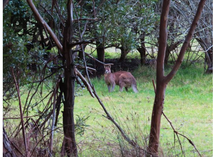
One of the kangaroos seen during the day.