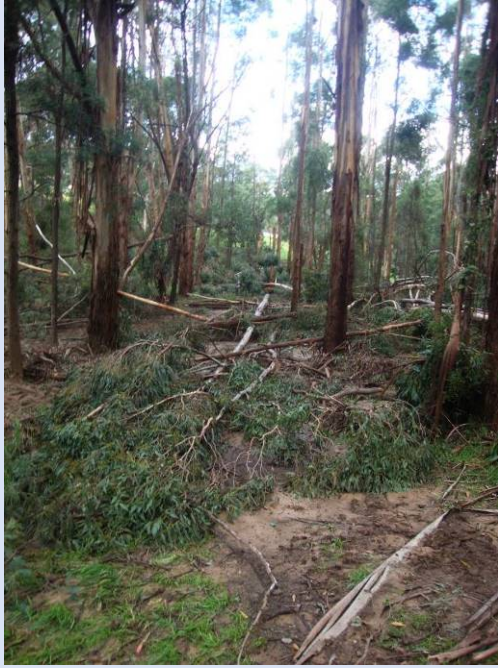
The main Billy's Creek walking track soon after the storm. Many fallen trees and at least a foot of mud on the track.