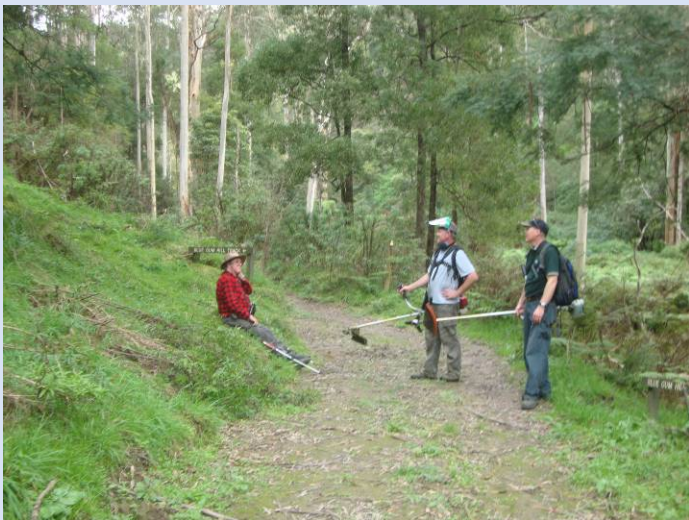
The beginning of the Grand Strzelecki Track & the Blue Gum Hill spur tracks (in 2014).