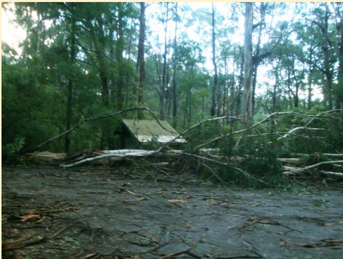
Kerry Road Picnic Area – In June 2021.