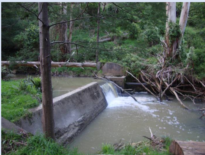
Billy's Weir (from 2011)