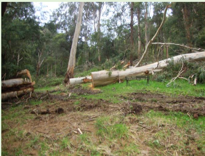
This is beginning of the Blue Gum Hill track.