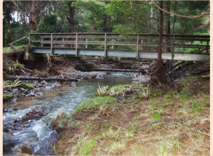
The one surviving bridge. The flood at its peak was over the bridge. There is much creek mud on the bridge surface.