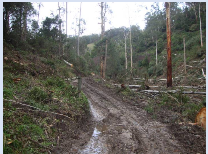
The beginning of the Grand Strzelecki Track (now). The storm has greatly changed the outlook.