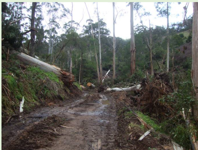
The storm has greatly impacted upon the Grand Strzelecki Track alongside Billy's creek.