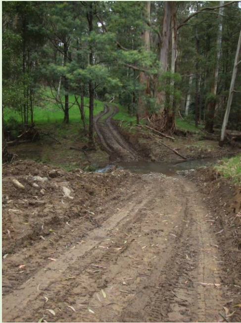
The creek crossings have been remade with much mud removed to allow vehicle crossings.