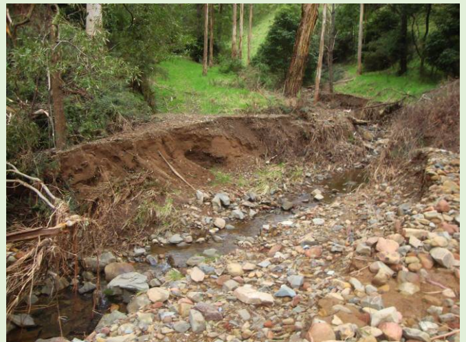
This is the small side creek (you would normal step over) at the base of Blue Gum Hill. It is now a large crevice.