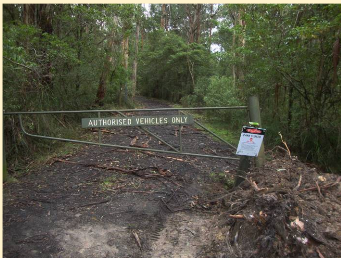
The main gate (at Kerry Road) has been reinstated. The tree that fell across the picnic area was at the base of the gate.