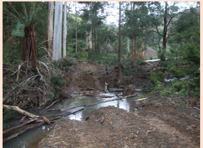
These are the first two creek crossings on the Grand Strzelecki Track. The creek crossing have been remade (mud removed) and large branches have been used to support large vehicles to move further down the track.