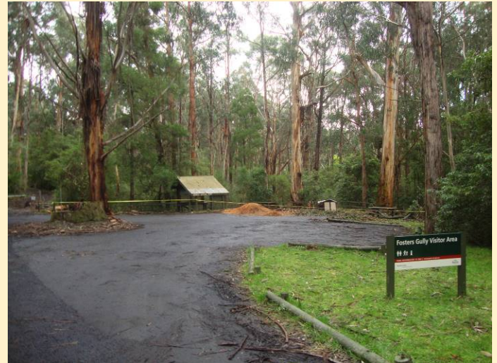
Kerry Road Picnic Area – In July 2021.