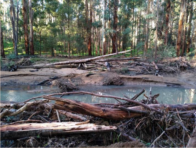
The bridge across the creek linking to Baniff Road has been found! Washed up the creek bank – under the fallen trees.