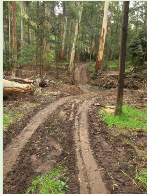
The creek crossing at Potato Flat.