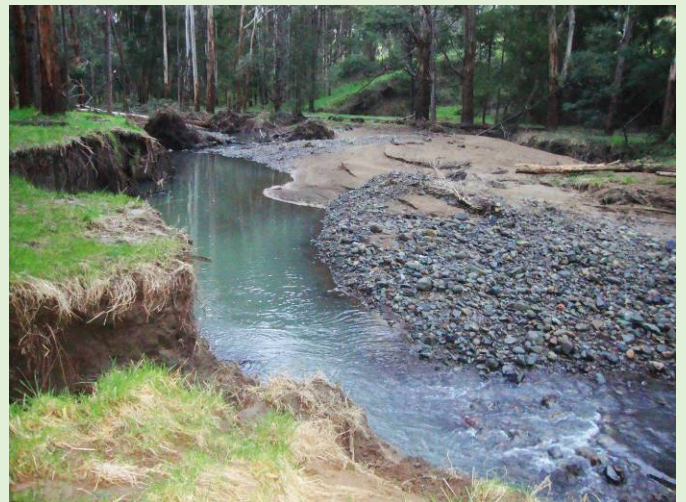
The storm has changed the nature of the creek, creating rocky banks and changing the direction of the creek.