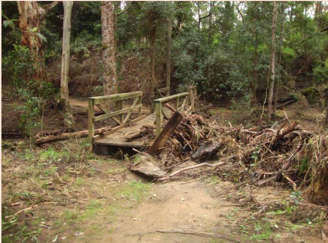
The bridge at Potato Flat was picked up by the flood and moved downstream against two trees on each side of the bank. It has been raised by at least 2 feet.