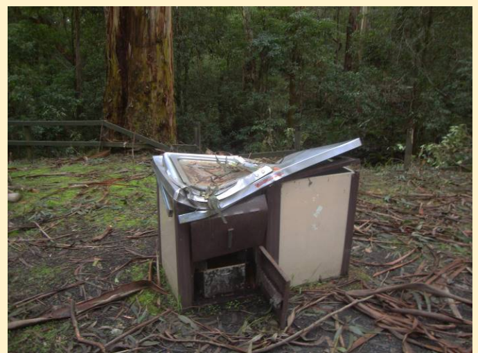
The barbeque (Kerry Road picnic area) had a large tree fall across it and will need to be replaced.