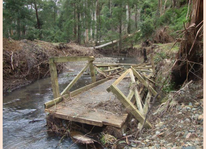
The bridge closest to Billy's Weir is now in the creek. If you are to travel to the Weir you will need to enter the creek.