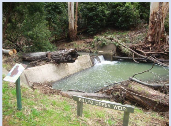
Billy's Weir (now)