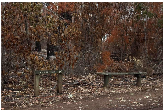
Seat and track marker (top of Stringybark Ridge Track) saved from the fire