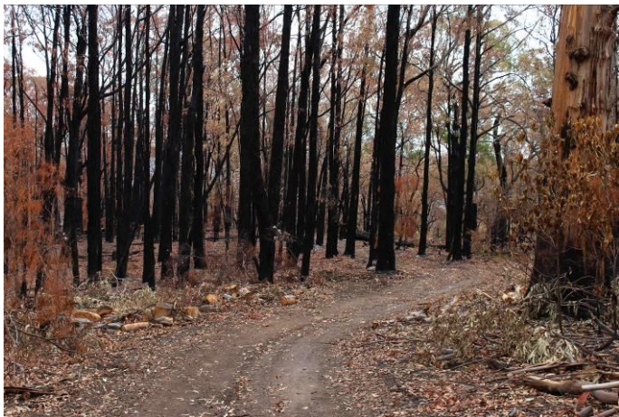
Stringybark Ridge Track cleared