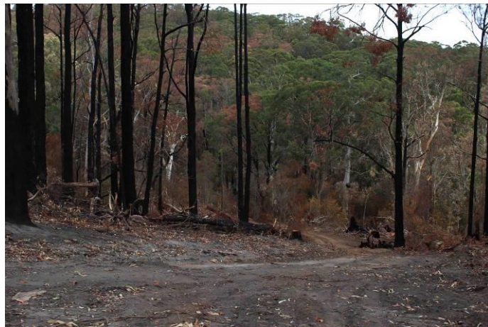
Track heading to Silvertop Hill

The hope that in the near future that we will get consistent rains so that there will some regrowth around the Park and in the burnt areas. The ground currently is very dry and a lot of rain will be needed for the soil to take in the moisture.