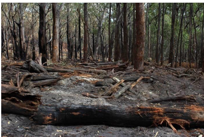
Fire Break reinstated

As part of fighting the fire, the fire services cut a new track across the hillside as a firebreak and as a way to move their equipment in to fight the fire. This track has been 'filled in' with fallen trees and branches; and the original walking tracks have been reinstated. The crews who have worked to reestablish this area have done a great job with the fire break now being difficult to identify and the walking track reconstructed into a solid surface of vehicle width. The many trees and branches which had fallen across the walking tracks have now been removed.