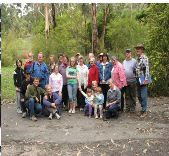
APS Keilor Plains Group- 28/9/08

Friends of Morwell National Park Inc: PO Box 19, Churchill, 3842